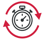
High speed printing up to 228 m/min