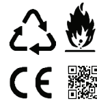
Graphic 1D/2D codes up to 600dpi