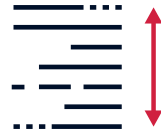
Up to 4" print height